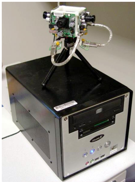
Fig. 3. CAMEO panoramic video capture device.

As part of the meeting recording architecture, CAMEO generates panoramic images in real time and streams them to an MPEG-4 movie file that can be used for off-line processing. While CAMEO can process video data directly from its cameras, it can load and process these movies off-line which allows the state information to be extracted and used as part of the larger meeting understanding problem.